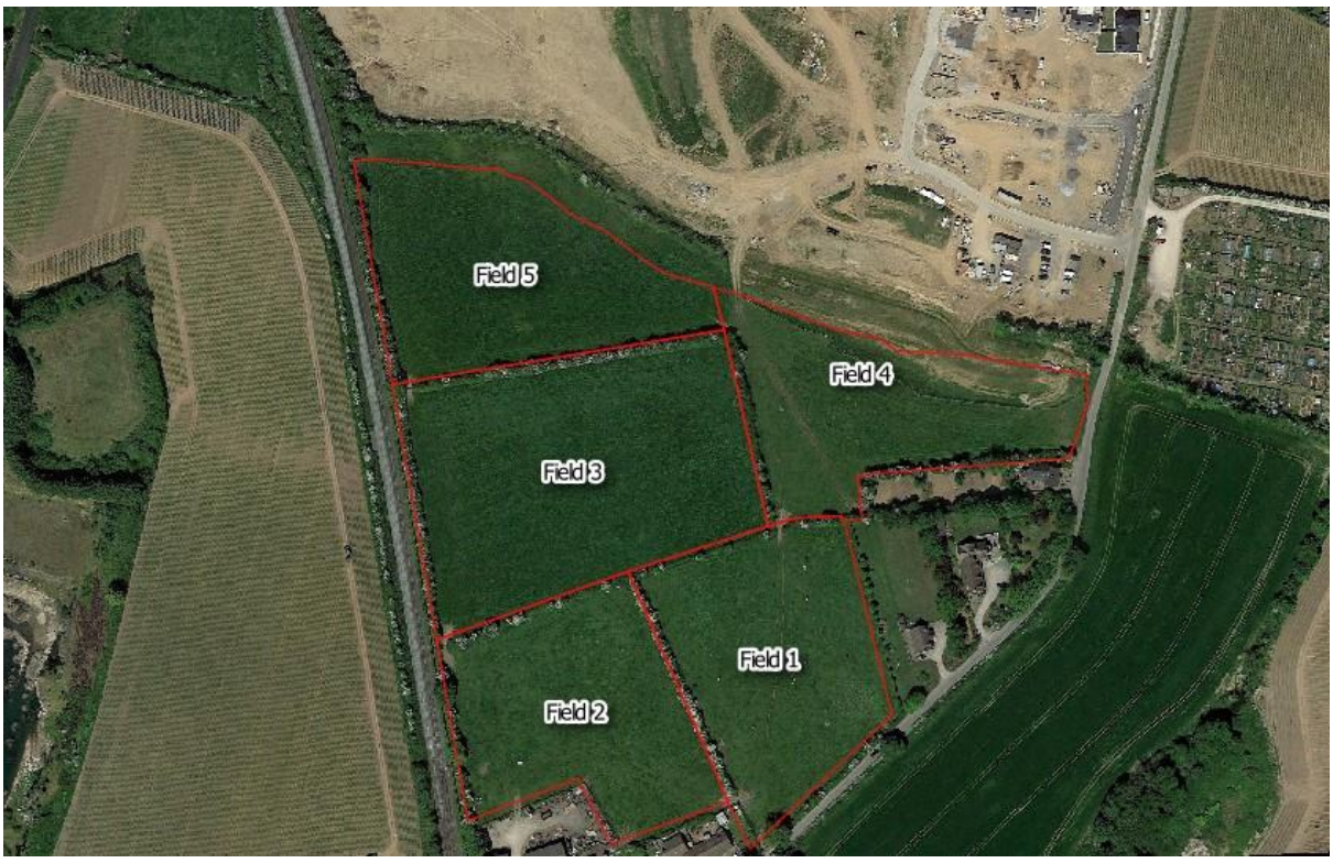
Plate 4.1: Google Earth (2016) coverage of the site

For ease of discussion the proposed development area has been divided into five fields (Plate 4.1). Field 1 gently slopes down to the northeast and comprises uneven pasture. It is bounded by mature vegetation on all sides except the east. The townland boundary between Milverton and Hacketstown forms the southeast limit (Plate 4.2). Field 2 undulates east to north, it is bounded by a farmyard to the south, the railway and mature vegetation to the west and mature vegetation to the north and east (Plate 4.3).