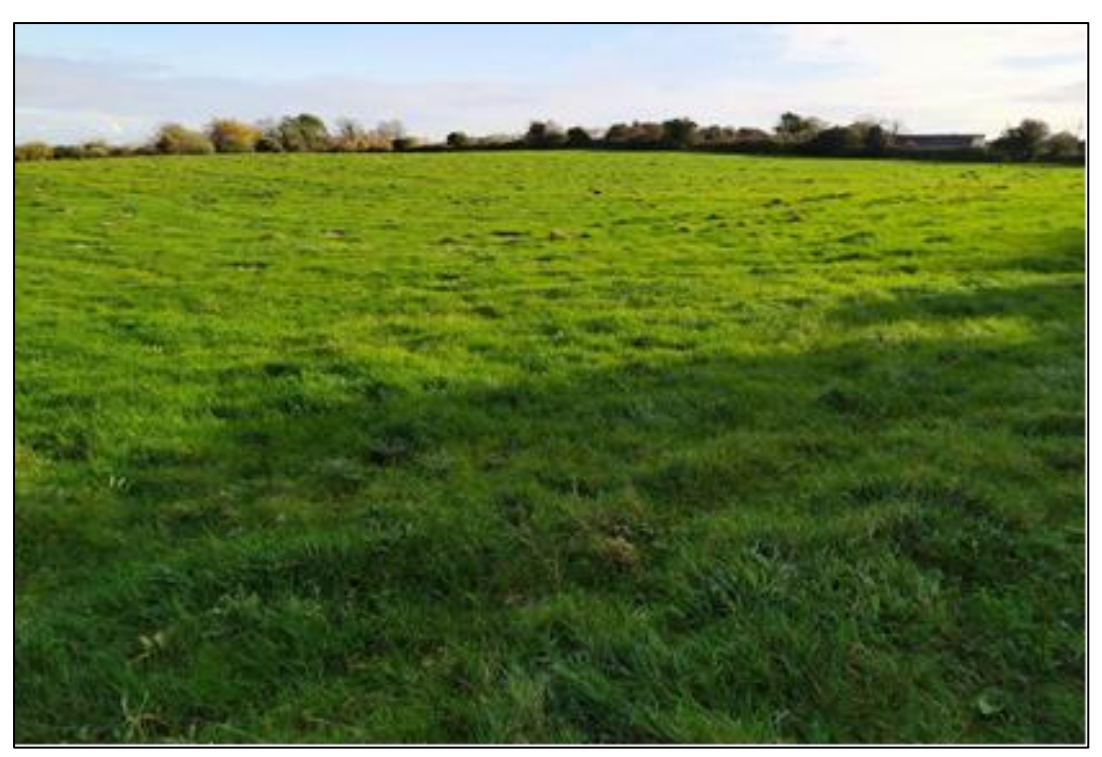
Plate 4.4: Field 3, facing southeast