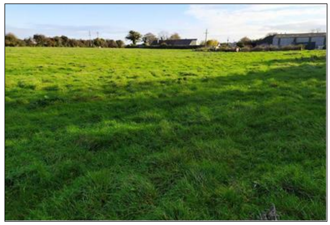
Plate 4.3: Field 2, facing southeast

Field 3 also undulates east-west and is bounded by the railway and mature vegetation to the west. It is bounded on all other sides by mature vegetation and the field slopes down to the north (Plate 4.4). Field 4 is bounded by two townland boundaries to the northeast and east and mature vegetation to the west and south. The townland boundary to the east, between Milverton and Holmpatrick, comprises a stone wall within a mature hedgerow. The townland boundary between Milverton and Townparks consists of a stream and mature vegetation. The field slopes down to this stream (Plate 4.5).