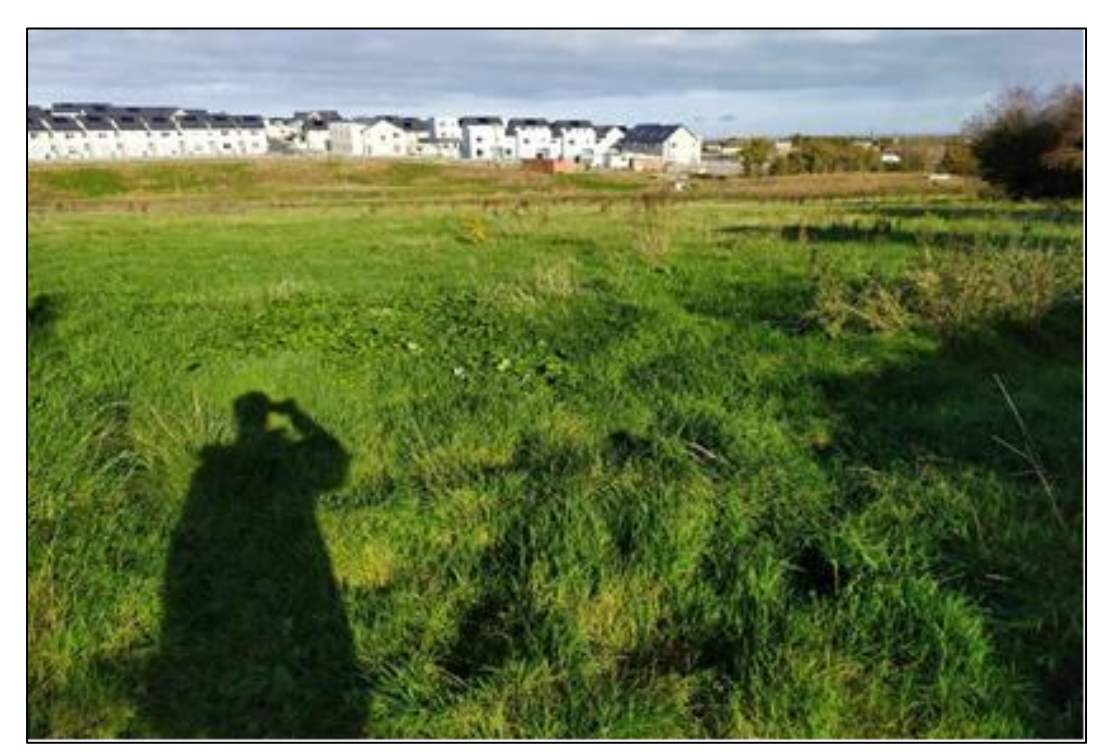
Plate 4.5: Field 4 towards townland boundary between Milverton and Townparks, facing northeast

Field 5 slopes down to the stream in the northeast forming the townland boundary between Milverton and Townparks and rises to the southwest corner. The western boundary consists of railway and mature hedgerow and the southern boundary mature vegetation (Plate 4.6). There is no division between Field 5 and Field 4 to the east. No previously unrecorded features or areas of archaeological potential were noted during the field inspection.