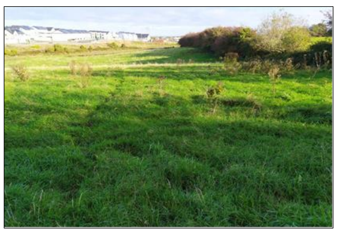
Plate 4.6: Field 5 towards townland boundary between Milverton and Townparks, facing east-northeast