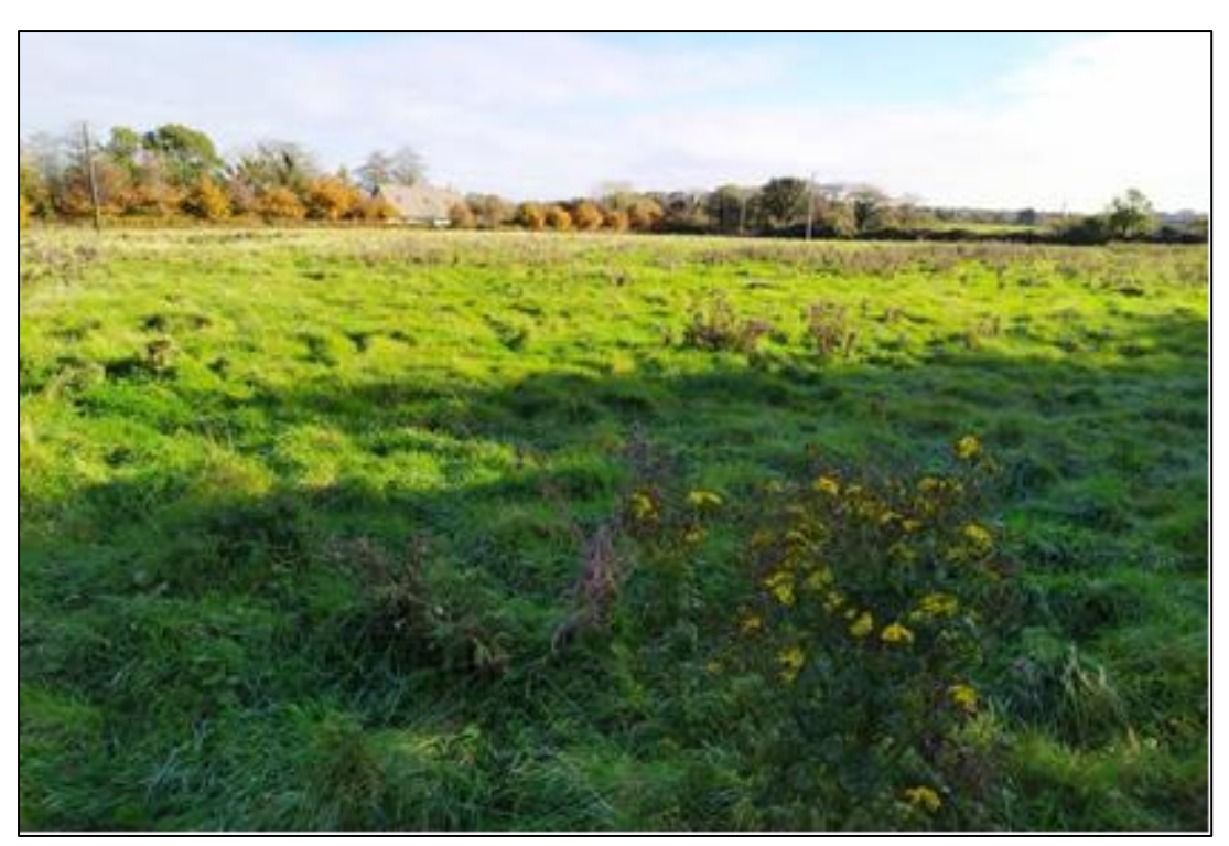
Plate 4.2: Field 1 towards townland boundary, facing southeast