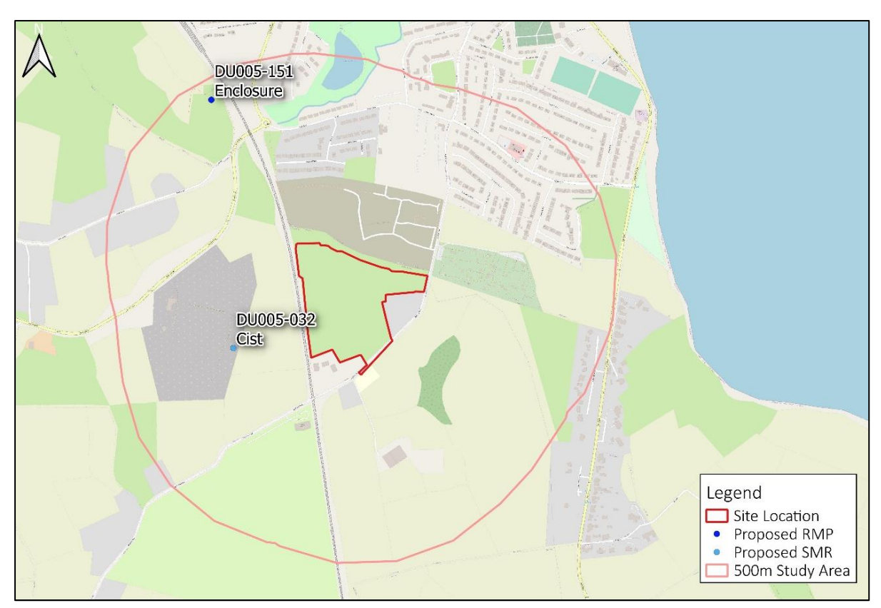
Figure 4.2: Archaeological sites within the study area